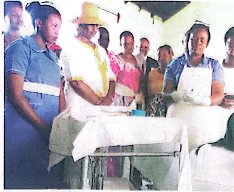
Health. Students of Masaka School of Comprehensive Nursing demonstrate to Education minister Janet Museveni (2nd left) how to handle a patient on Monday.

Appeal. Nursing school principal calls for more funding to health training institutions